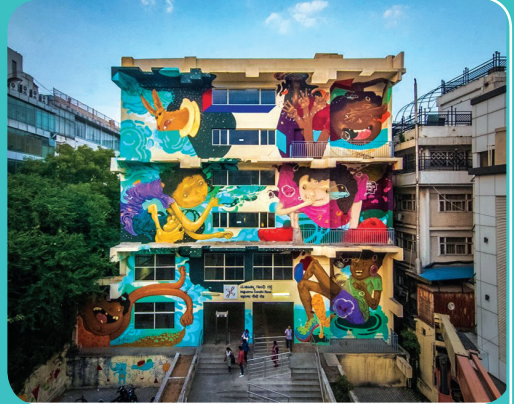
Bengaluru - MG Road Metro Station