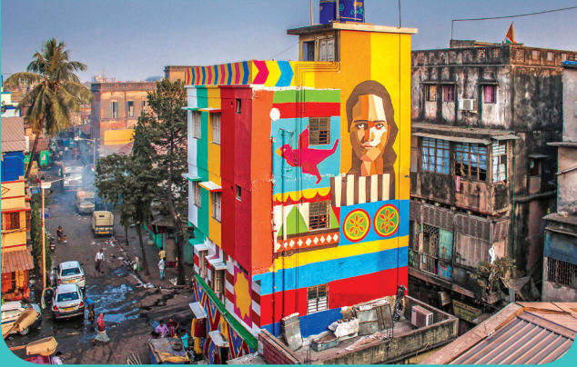
Kolkata - Sonagachi