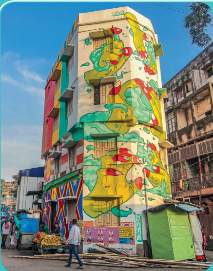
Kolkata - Sonagachi